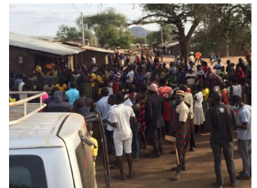
Hearing the Gospel at a recent crusade