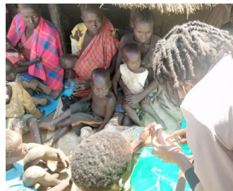
Ik villagers at a recent medical mission

Many of the IK have heard the name of Jesus but they don't understand what Jesus has done for them and the implication for their lives. Only Mark, Ruth and parts of Genesis have been translated into their language. Some "Bible stories" also exist in their language. Several Christian groups are resent among the Ik and have built church structures, but there are no indigenous pastors.