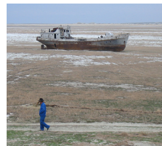
Orphaned ship in former Aral Sea, near Aral, Kazakhstan.

Kazakhs are facing ecological catastrophe due to the mismanagement of natural resources. This has caused the near desolation of the Aral Sea and contamination of much of their drinking water. As a result, the infant mortality rate is very high. The Kazakh church is young, but the church is growing. Over 40 Kazakh speaking churches exist, but in a people group of over eight million, that is a small number. Many churches are located in the major cities like Almaty, but Christian workers are also needed in the rural areas.